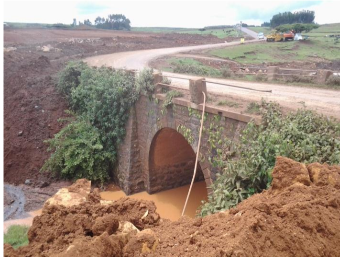
One of Old Masonry Arch bridges found on sharp curve road alignment and susceptible to frequent car accident

As the replacement is undergoing, priority should be given to those located along sharp curves and having scour problem in central piers or abutments.