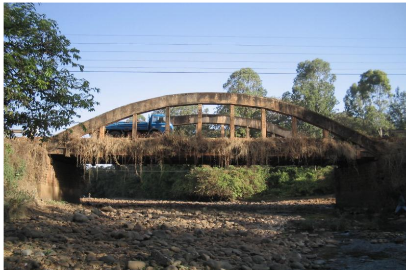
One of the old RC Arch bridges being replaced, Lah bridge, Finoteselam,