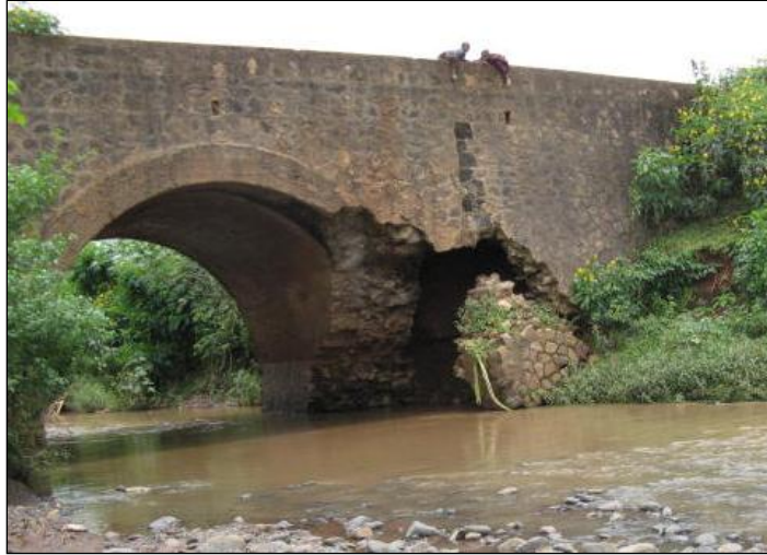
One of the old bridges replaced due to scour problem, Washamo bridge, Gedo-Bako, ( A4-4-10)