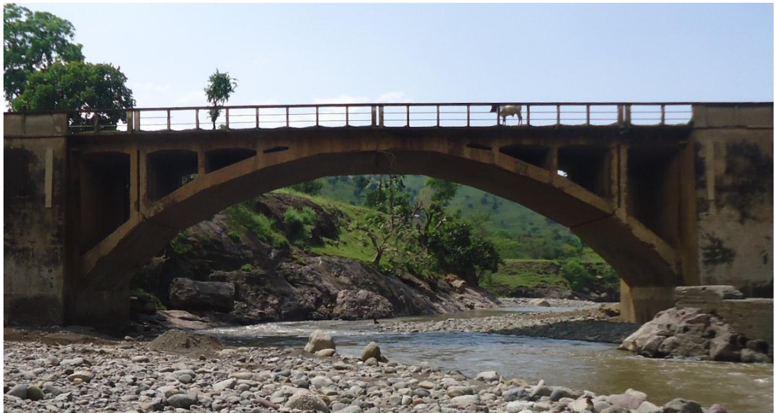
One of architecturally beautiful RC bridges , Boya River Bridge, Adiarkay - Tekeze

Note:- Any kind of detail technical information on Ethiopian Arch bridges including pictures before and after for those replaced as well as short video clip of existing bridges can be obtained in BMS database at ERA Bridge management team office.