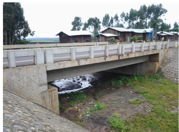
Some RC Arch bridges are also replaced by RC girder due to serious defects, A3-