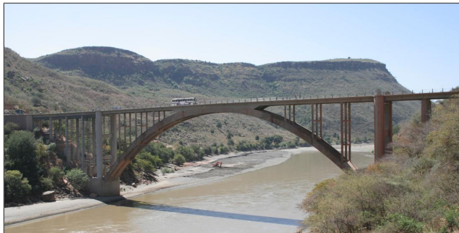
The famous Abay River RC Arch Bridge, 210 mt long, (A3-4-001)

There are few RC arch bridges in Ethiopia. To mention long ones, there are Abay River Bridge at the middle of GohaTSION - Dejen route and Awash River Bridge along Alemgena - Butajira route built by Italians. Aesthetically beautiful some RC arch bridges are also found along Woreta - Woldya route built by Chines in 1980s.