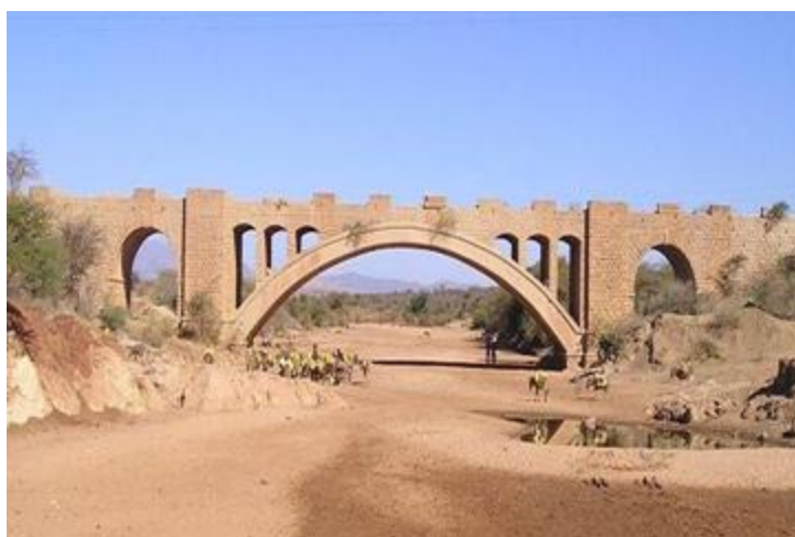
One of replaced arch bridge, Bombas bridge , Bombas-Jijiga, A10-7-008