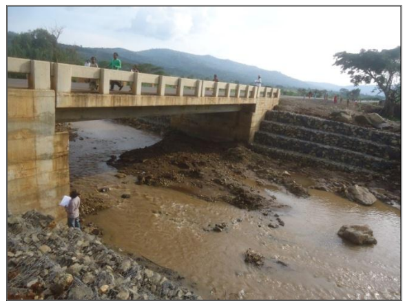
Example of bridge pictures before and after replacement.