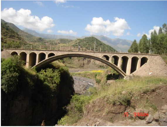
Ginbora bridge, Woldya-Dilb route (B22-1-008)