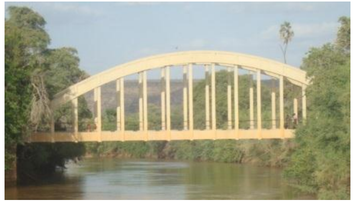
One of still serving RC Arch bridges,